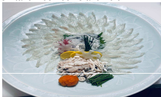
2 portions of sashimi