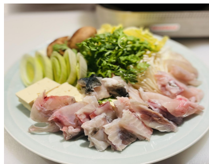
2 portions of nabe hot pot