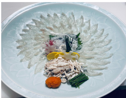
2 portions of sashimi