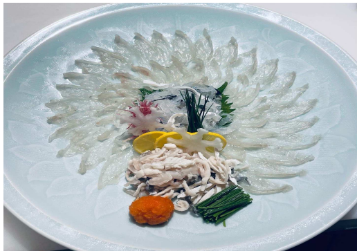
2 portions of sashimi

Fugu casserole with various Japanese vegetables, shiitake mushrooms and Tofu.