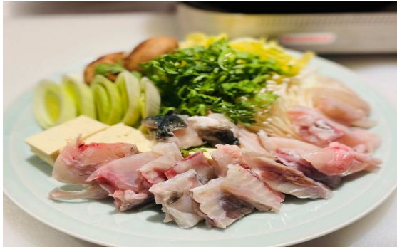
2 portions of nabe hot pot