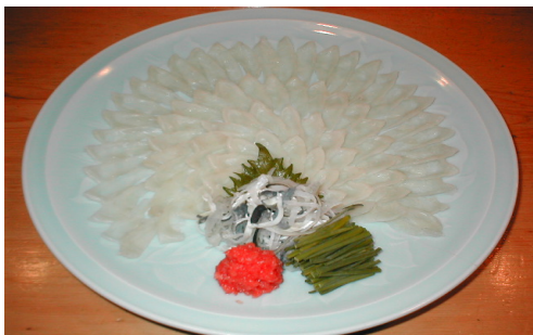
ふぐ刺し3人前大皿盛込み Fugu Sashimi 3ptns