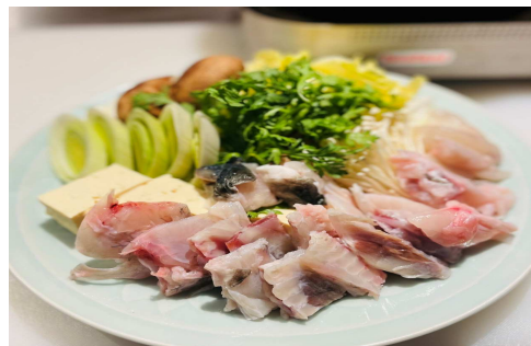
Nabe 2 Portion