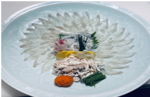
Sashimi 2 Portion